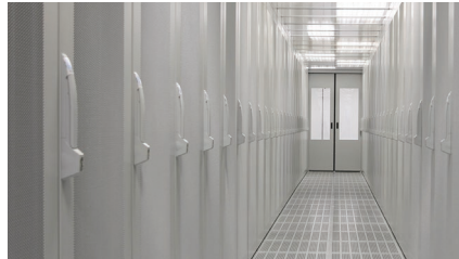
Equinix Manchester IBX data center*

The Manchester IBX data centers consist of four buildings totaling 80,000+ square feet (7,425+ square meters) of colocation space. They offer scalable technical space, leading operational resiliency and world-class security.