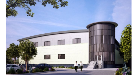
Equinix Manchester IBX data center